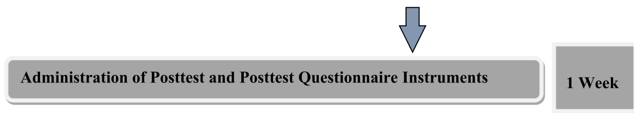
Figure 1: Phases for Data Collection Designed by the Researchers